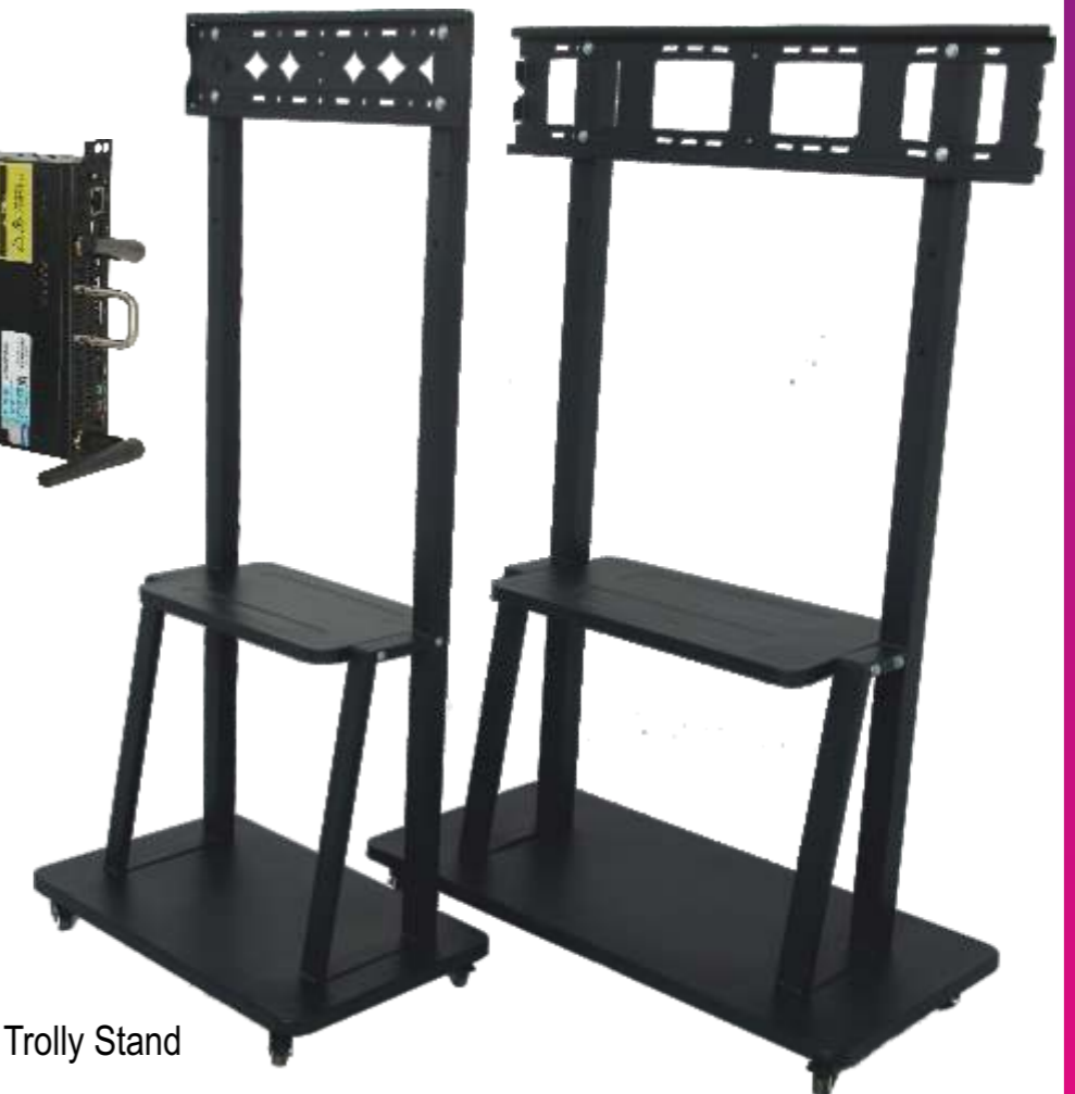
IFPD Movable Trolley Stand