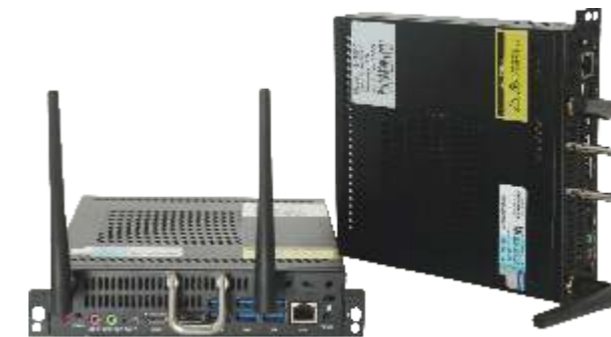
OPS Mini PC with Pre Installed License version of Windows 10 Pro Software